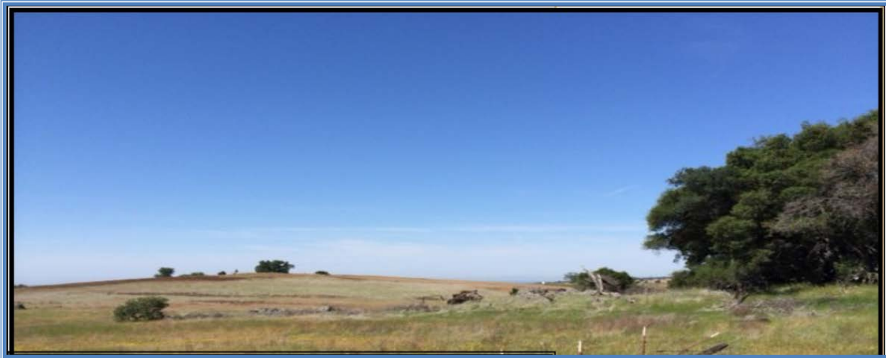
Sienna Ridge School Site – 21+ Acres

On Tuesday, September 8 th , 2015, the Rescue Union School District Board of Trustees will vote to enter into a purchase and sale agreement on two parcels of land on Sienna Ridge Road near the corner of Bass Lake Road and Serrano Parkway for a total of $1.625 million.